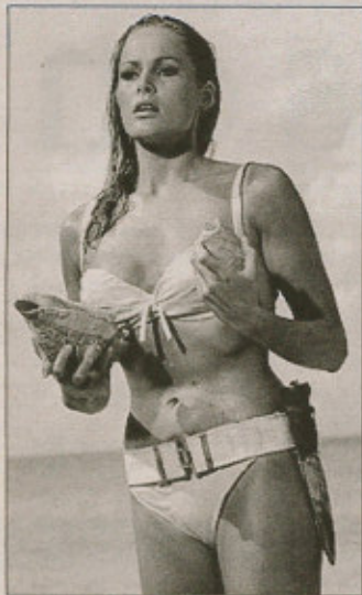
ICONIC: Andress in Dr No